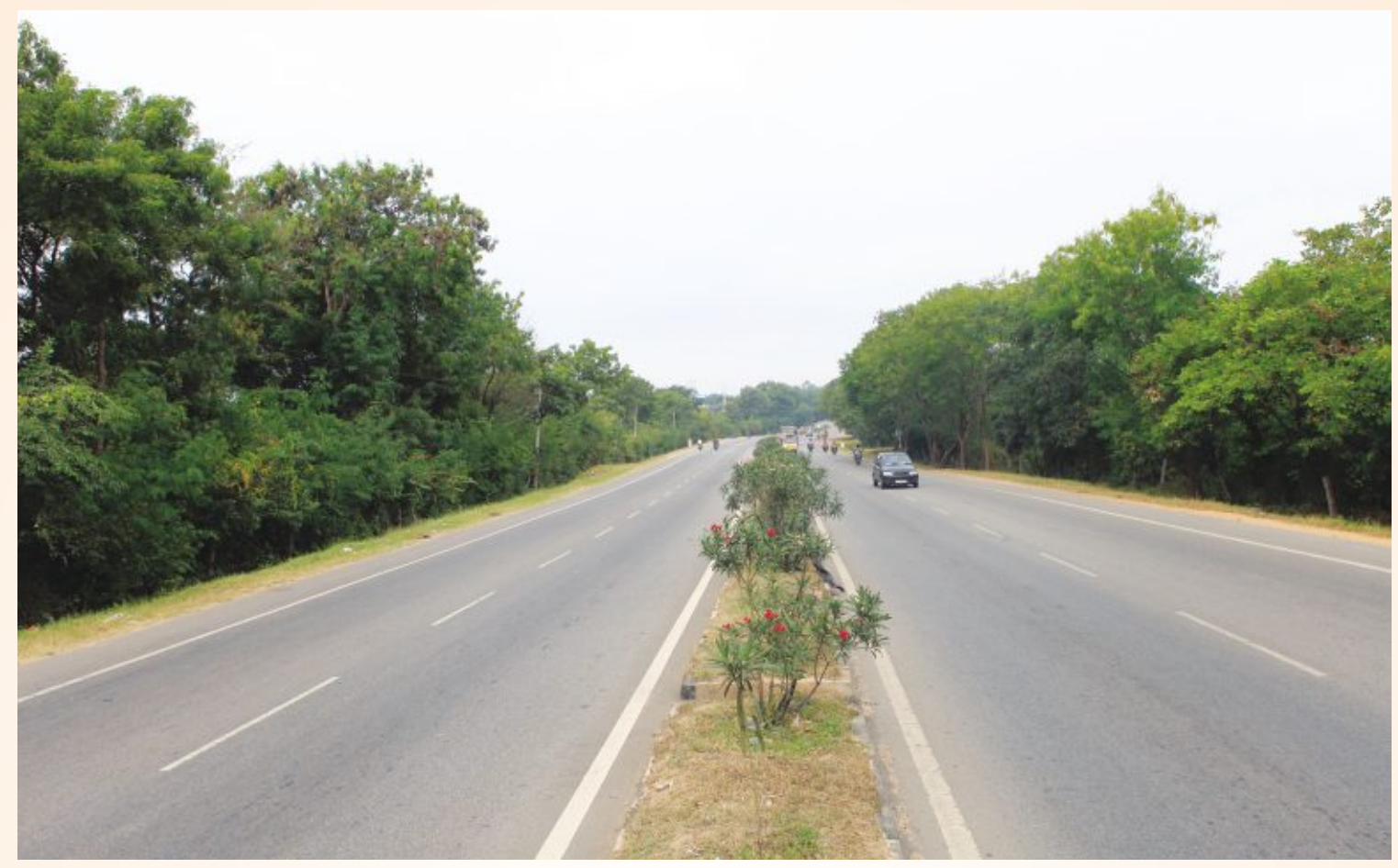
NATIONAL HIGHWAY No. - 44