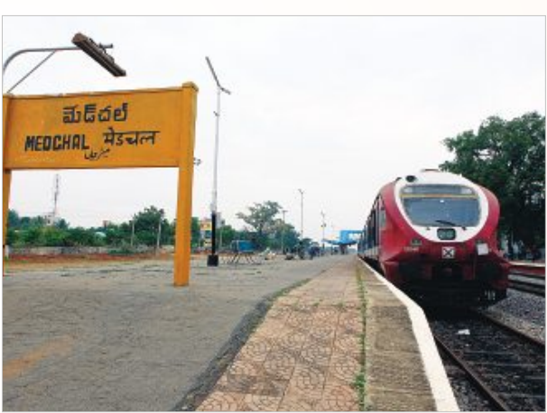
MEDCHAL MMTS HUB