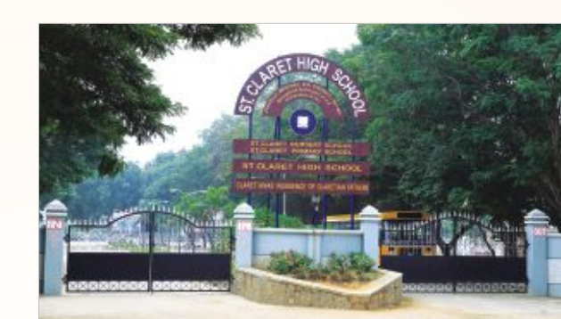
ST. CLARET HIGH SCHOOL

Ganga Grandeur is strategically located between National Highway No 44 and MMTS Railway Station. The one-hour MMTS frequency will take you to the city effortlessly. The close proximity to Kompally and Kukatpally makes it a preferred destination. The finest International schools are within 10-15 minute drive distance. Medchal will be the address for IT, MNCs, hardware and automobile industries, with connectivity to HITEC city and airport through Outer Ring Road.