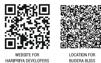
WEBSITE FOR HARIPRIYA DEVELOPERS

email: info@haripriyadevelopers.com www.haripriyadevelopers.com